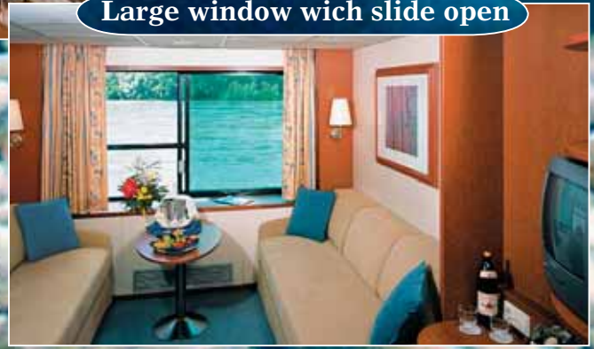
Large window with slide open