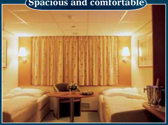
Spacious and comfortable