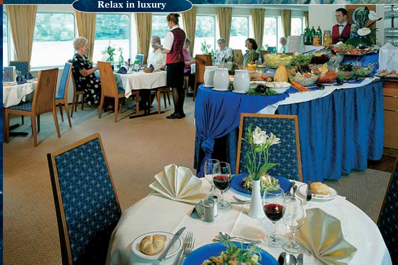
Relax in luxury